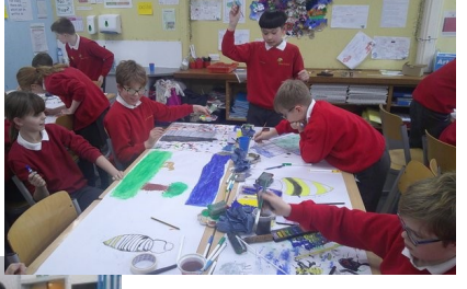
Gymnastics, music and art in Year 6