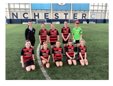
Football teams and cricket team!