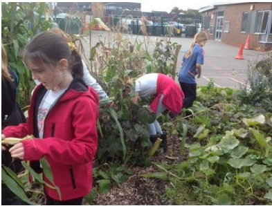
Harvesting vegetables and digging out the pond in outdoor learning sessions