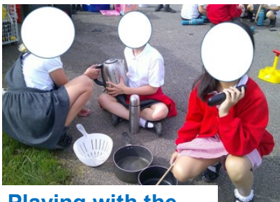
Playing with the equipment and creating stories during Imaginative Play