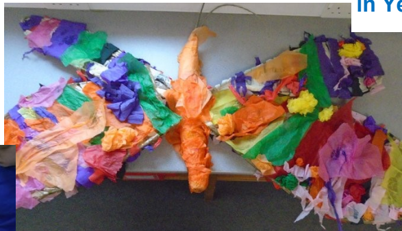
Using Modroc in Year 4 and the finished products from Year 3 and Year 5- butterfly alebrije in 3FP and elephant alebrije in 5W