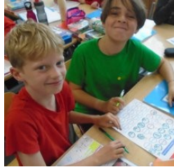
Using manipulatives and playing games to help secure our place value knowledge across the school