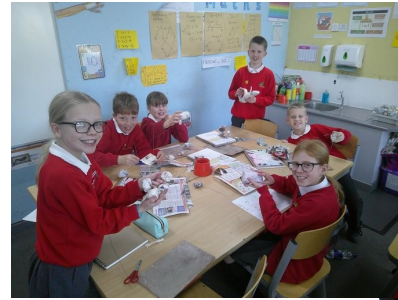
Creating sculptures in Year 6