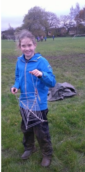
Enjoying Forest Schools sessions in Year 5!