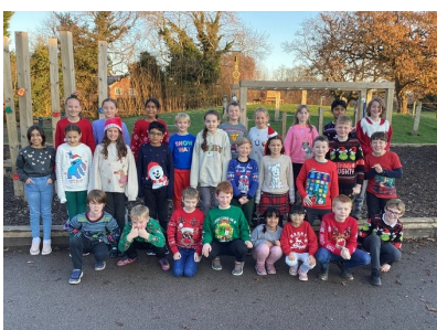
Looking festive on Christmas Jumper Day!