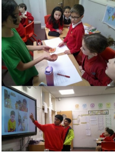
Learning about Diwali in Year 4 from our Hindu pupils in Year 5